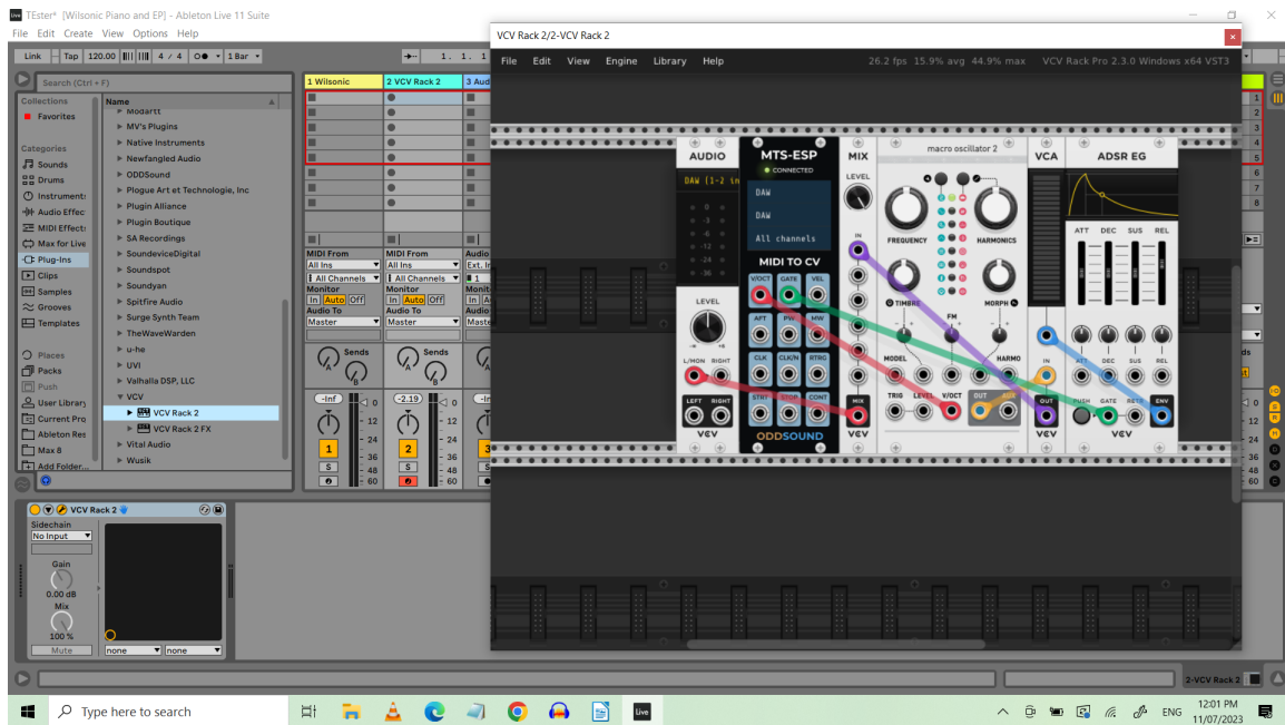
Figure 1: Simple microtonal patch in VCV Rack Pro 2