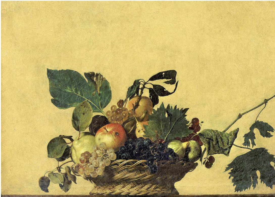
Figure 1: Caravaggio's Basket of Fruit 1597/1600.