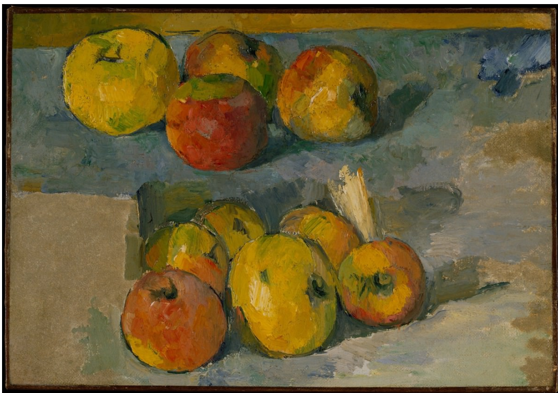
Figure 2: Cézanne's Apples 1878-79.